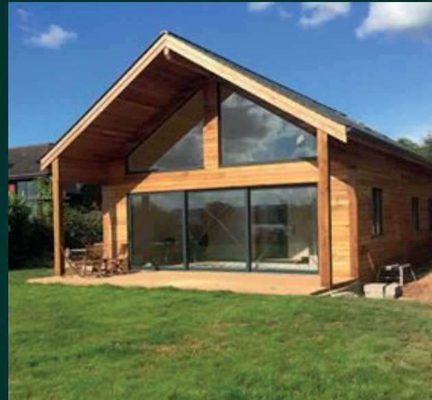
The Fistral 4 bedroom residential

All our Glamping pods come with 12 months warranty, we guarantee that our buildings will be free from any material and workmanship defects from the date of delivery or construction.